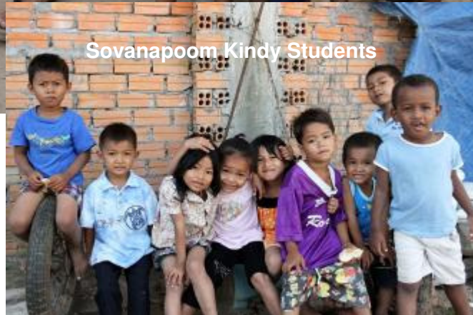
Sovanapoom Kindy Students