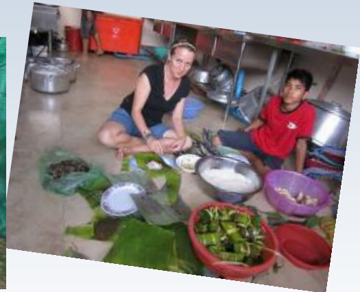
learning how to make banana desserts