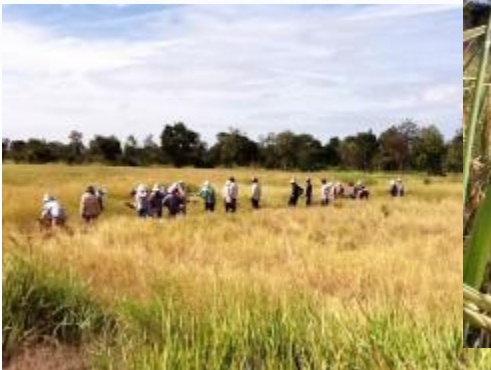
Workers harvesting rice on our farm