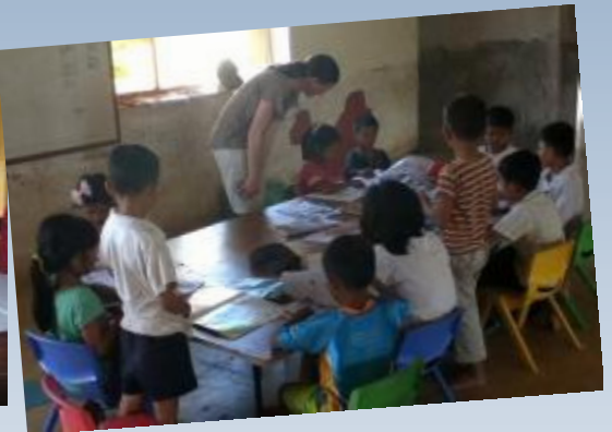
Volunteer teachers and the students