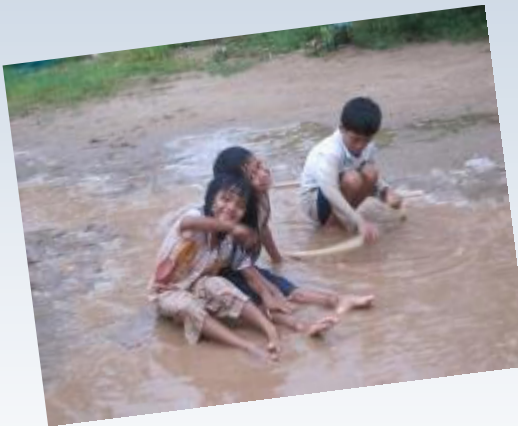
Playing in the water