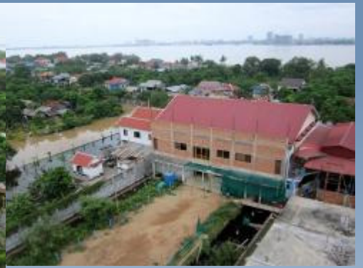
Sovanapoom Centre surrounded by floodwater (looking across river towards city)