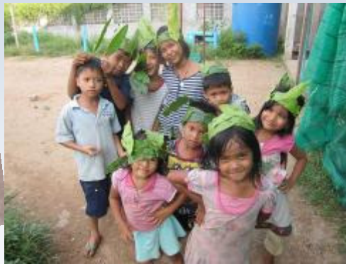
Having fun with leaves