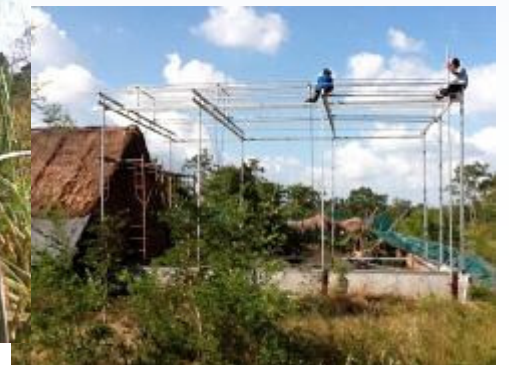
Students working on animal enclosure