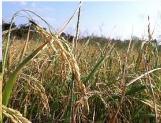
Rice ready for harvest